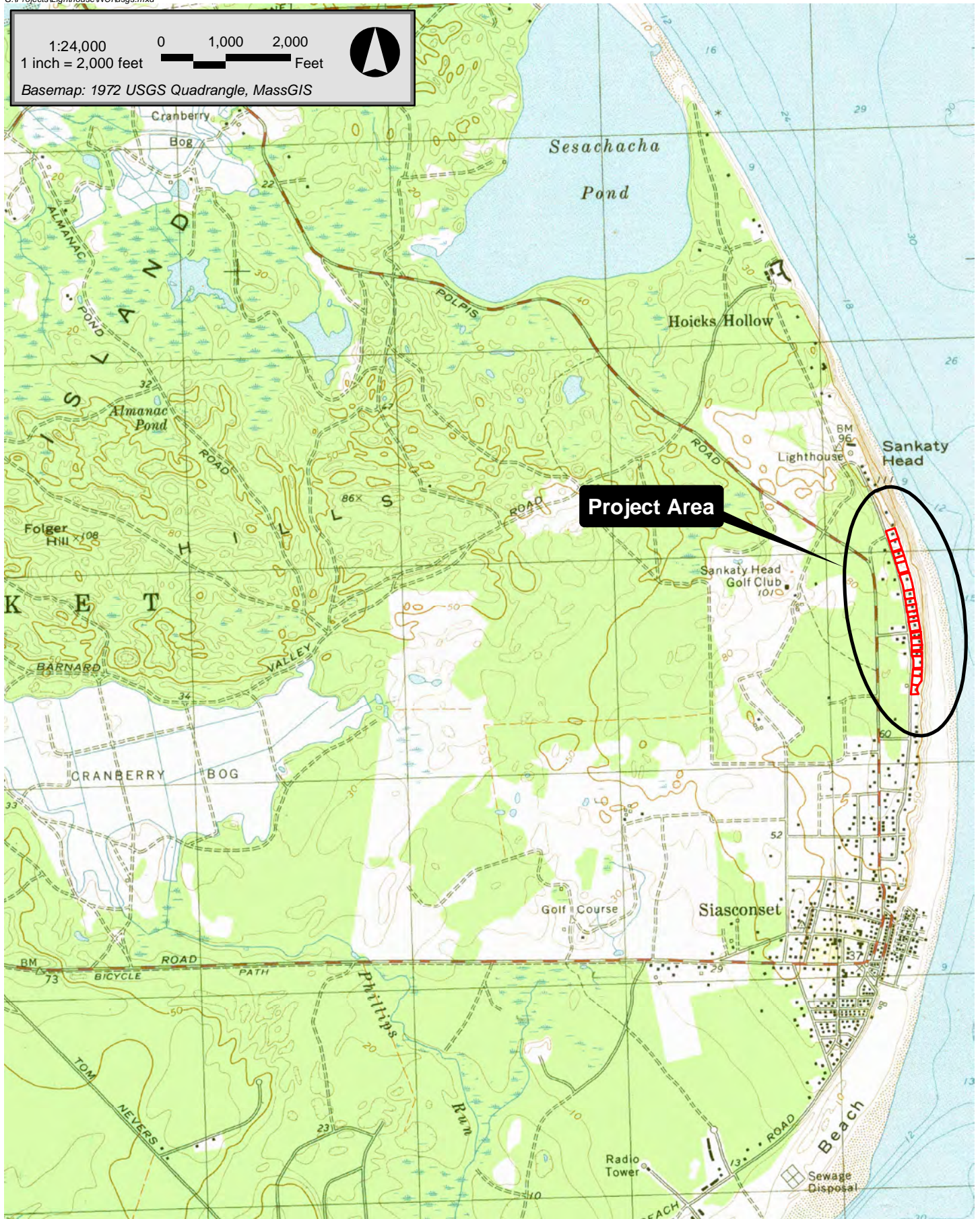
Siasconset Coastal Bank Stabilization and Beach Preservation Project Nantucket, Massachusetts